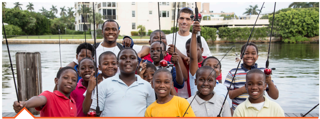
Angling for a Healthy Future program offered by the Florida Fishing Academy.

Introduction to video production and life skills